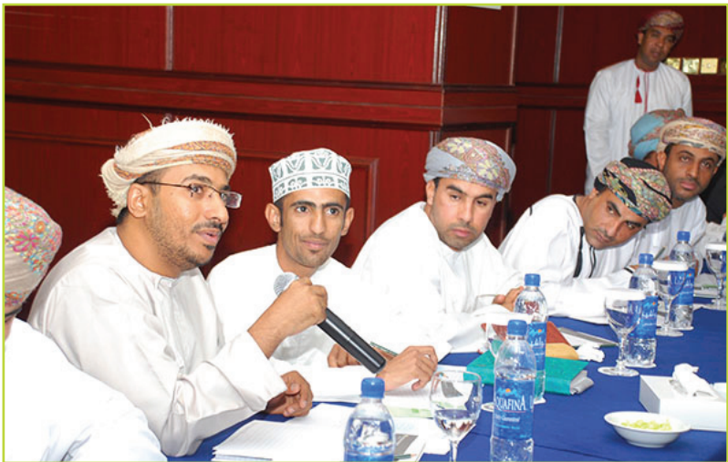
Participants interacting during the session.

This workshop was designed in cooperation with University of California at San Diego, Rady School of Management, Bester Institute, Civil Society Leaders Program, and Middle East Partnership Initiative (MEPI). The workshop aimed to improve communications strategies, concepts and challenges in the Omani Civil Society Sector.