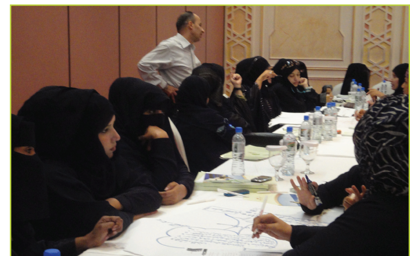
Participants preparing their presentations.

Tawasul presented a workshop on Strategic Planning and Leadership in partnership with IRI and OMIFCO for Civil Society Organizations in Salalah. The topics were: Organization Management and its volunteers, Strategic Planning and Leadership for CSOs with the aim to stretch their potential and have more social impact.