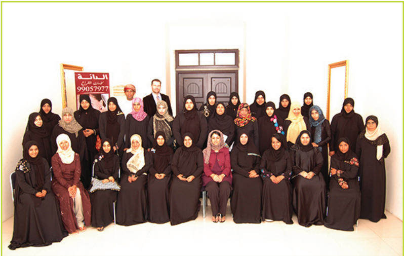
Facilitator with the participants

This workshop aimed at training Omani Women Associations on the importance and methods of networking with other organizations which hold similar goals. The main topics addressed: identifying organizations with similar goals, partnering with them and developing a database of contacts that can assist the organization in meeting goals.