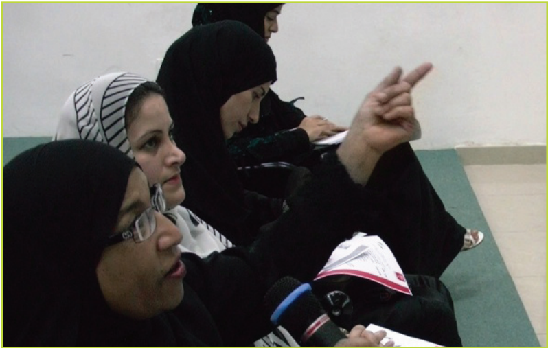
Participants interacting with the facilitator.

Aiming at empowering individuals at their personal presentation skills, OWA Muscat, in partnership with Tawasul, concluded this training workshop titled "Market Yourself", which focused on Job search and Public Speaking for 15 participants.