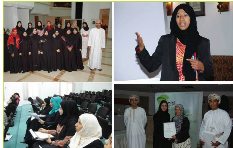
Photos of the Events

This activities are part of our mission to empower the civil society by providing the CSOs with skills to stretch their potential. Each workshop had approximately 30 participants, 7 hours of training and focused on different skills such as: public speaking, fundraising and sustainability, strategic planning and leadership, etc. Below are described our Capacity Building workshops for CSOs and OWAs.