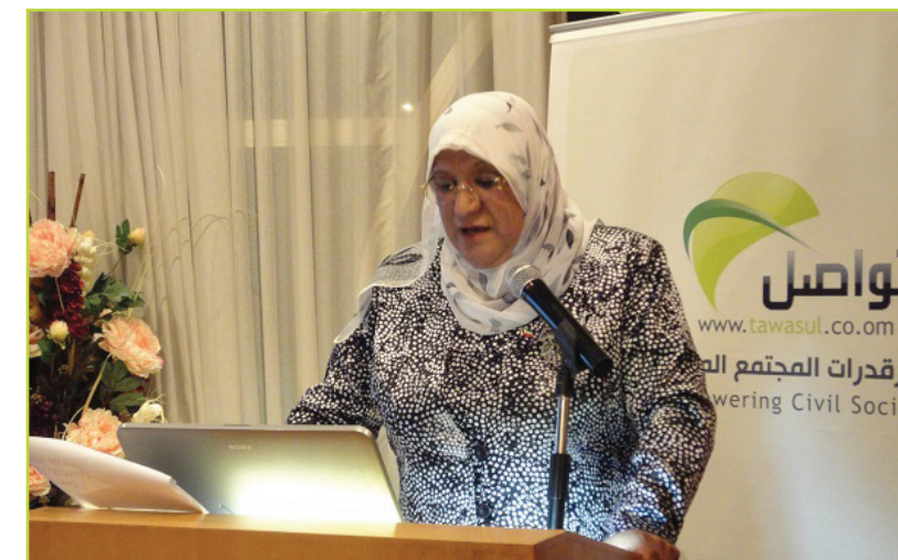
HE Dr. Masoma Al Mubarak, National Assembly Deputy, Kuwait.